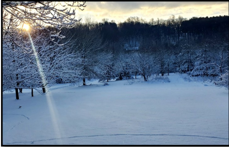
“For the Beauty of the Earth”

RETURN SERVICES REQUESTED DATED MATERIAL